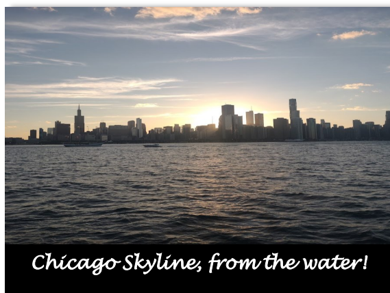
Chicago Skyline, from the water!