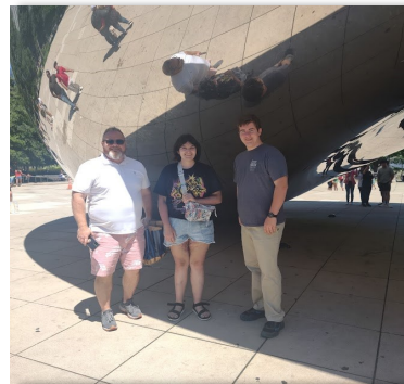
Hello to the Bean!