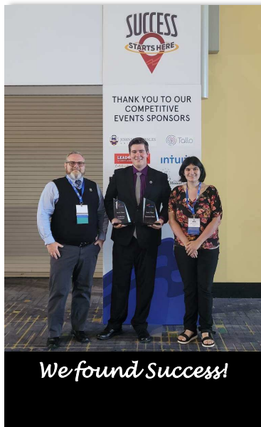
We found Success!